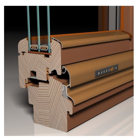
Makrowin MW88 Wood Window

As the most recent addition to our Passive House fenestration offering, the MW88 G2 window represents the state-of-the-art in engineered wood frame technology. This window was recently certified at the Passivhaus Institute (PHI) in Darmstadt, achieving U_{\epsilon} = 0.13 \text{ Btu/(hr.ft}^2.^{\circ}\text{F}) . At 88 mm thickness, this window profile represents the thinnest PHI-certified wood window design.