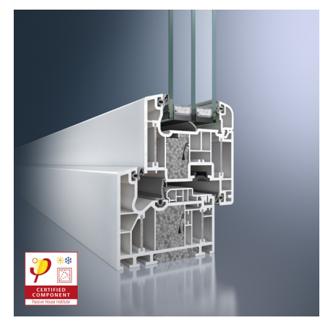
Schüco SI82 ThermoPlus uPVC Window

The Schüco SI82 ThermoPlus uPVC system with three drainage levels and patented aluminum reinforcement rolling technology is based on 7-chamber uPVC technology. This high-insulation system can be used to build passive and net-zero energy buildings with narrow face widths for houses, economically and to high standards.