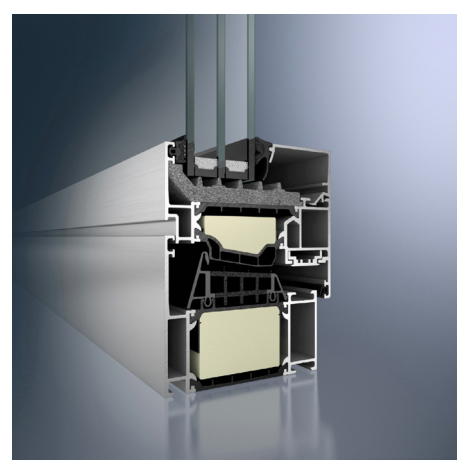
Schüco AWS 90.SI+ Aluminum Window

Schüco SI82 window systems have three levels of drainage and conventional steel reinforcing profiles. Thanks to industrial fabrication and fast availability. they can now be used to build low-energy windows for houses economically and to high standards. SI82 window and door systems are suitable for a wide variety of uses in both new-build and renovation projects. An extensive range of accessories ensures a high level of system security.