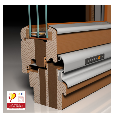
Makrowin MW88 G2 Wood Window

The Schüco AWS 90.SI+ aluminum window combines the benefits of aluminum with pioneering thermal insulation for sustainable architecture.